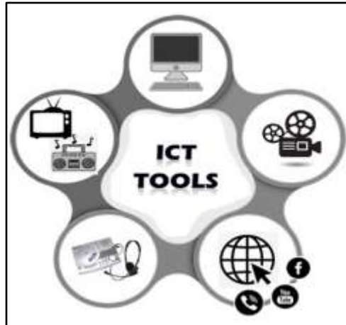
Figure 1 ICT Tools